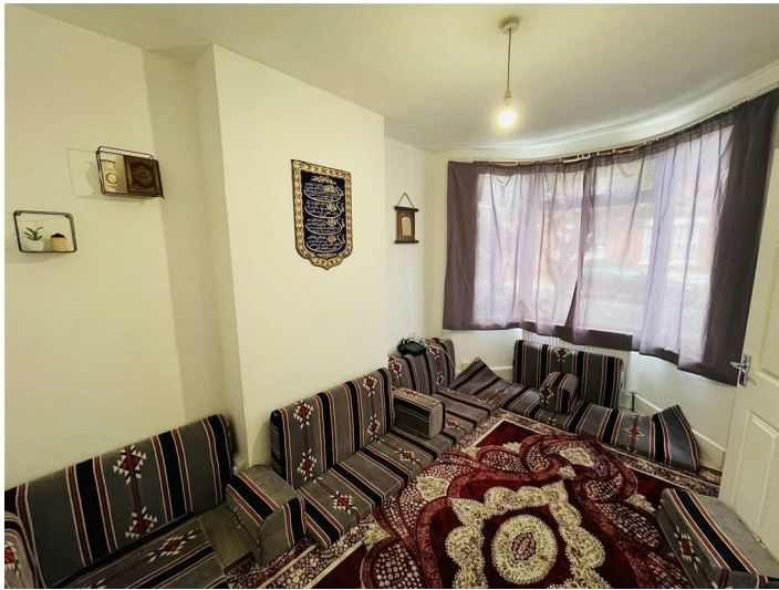
Reception Room 12'9" x 8'6" (3.9 x 2.6)