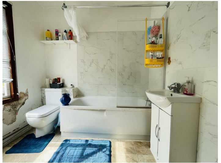
Bathroom 8'1" x 7'9" (2.48 x 2.38)