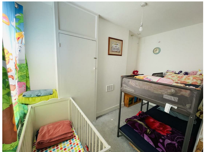
Second Bedroom 11'9" x 7'0" (3.6 x 2.14)