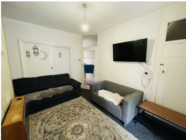
Dining Room 11'9" x 9'7" (3.59 x 2.94)